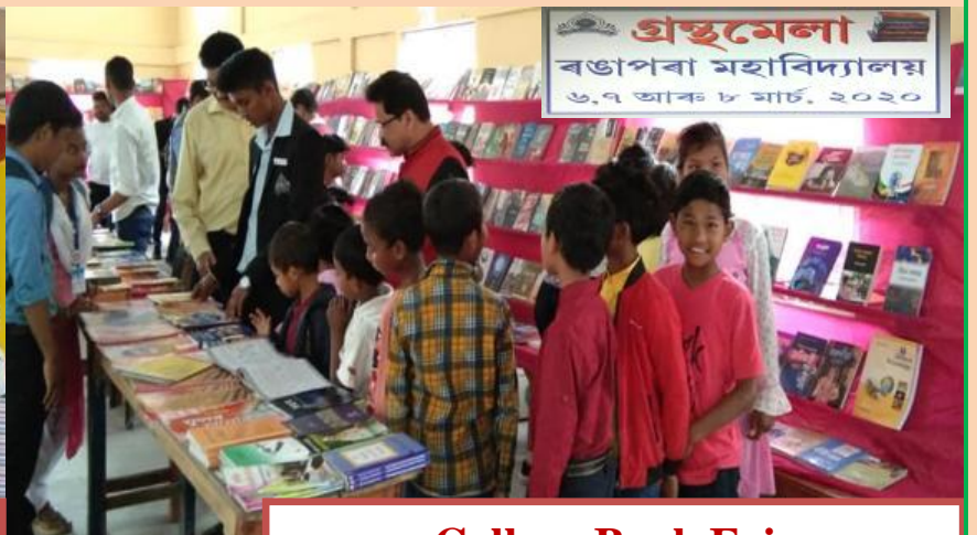
College Book Fair held from 6 to 8 March, 2020