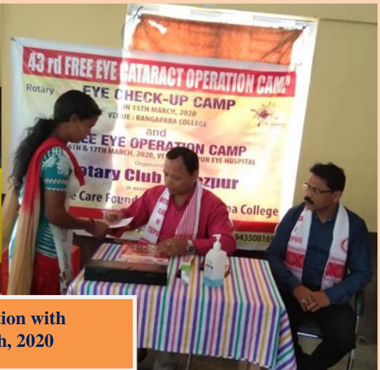
Free Eye Check up Camp in Association with Rotary Club of Tezpur, held on 15 March, 2020