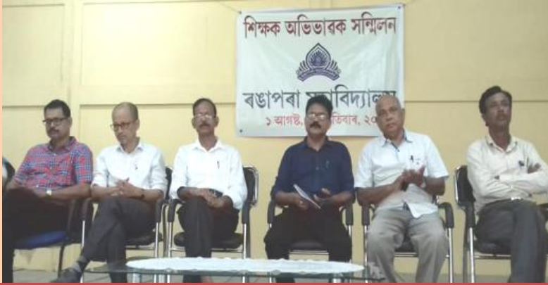
Parent-Teacher Meet held on 01-08-2019