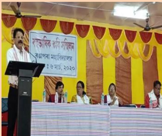
Multilingual Poets' Meet held on 06-03-2020