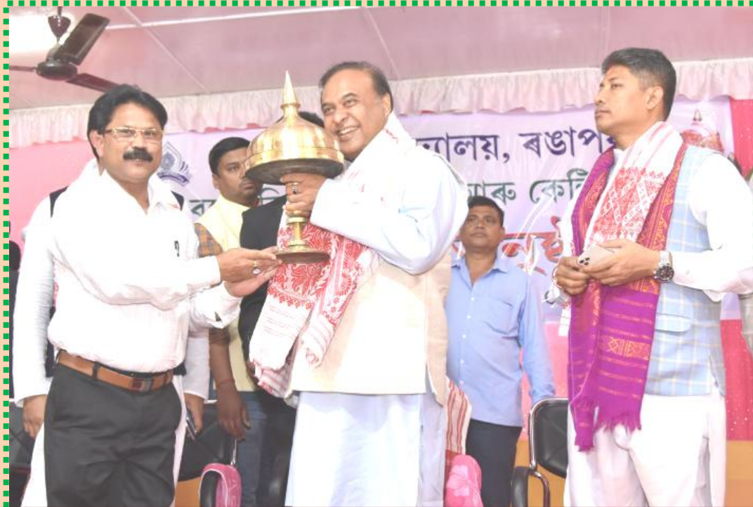
Dr. Himanta Biswa Sarmah, Honorable Minister of Education etc. Govt. of Assam (29-02-2020)