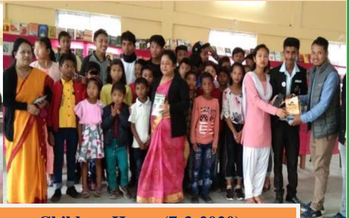
Gifted Text Books to Children of Mercy Children Home (7-3-2020)