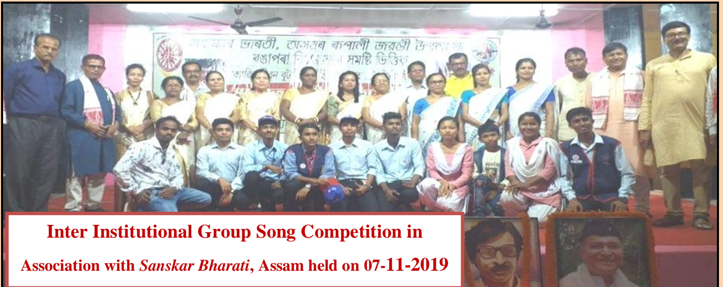
Inter Institutional Group Song Competition in Association with Sanskar Bharati , Assam held on 07-11-2019