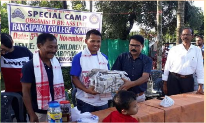
Donated Winter Garments to Children of Mercy Children Home (5-11-2019)