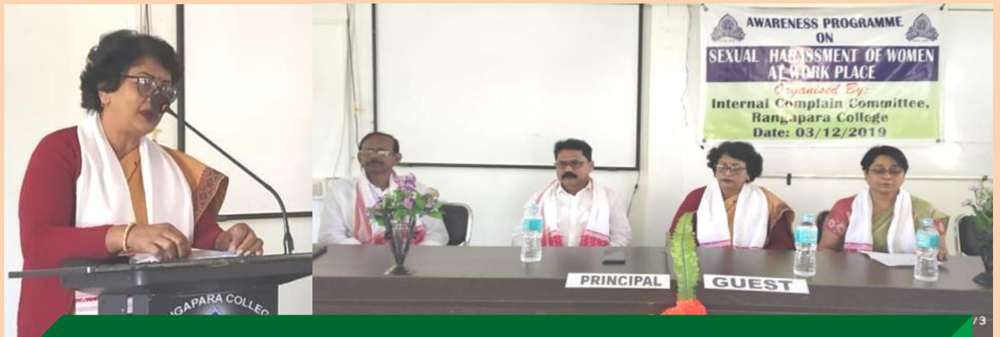
Awareness on Sexual Harassment of Women at Work Place (03-12-2019)