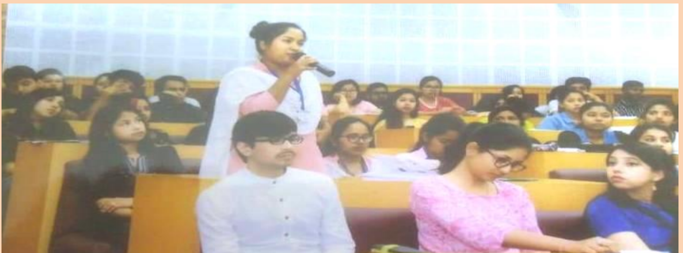
Students Participation in Gender Sensitization Programme at Tezpur University (16-03-2020)