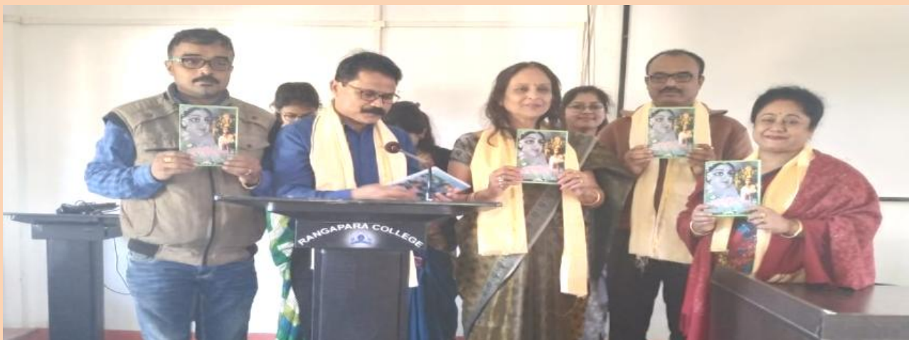
Departmental Journal Publication – Dept. of Bengali