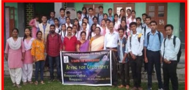
3 Days Workshop on Acting (NSD)