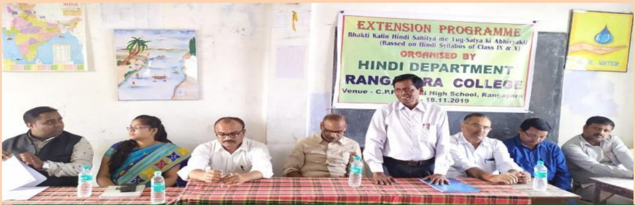
Teaching of High School Students by the Dept. of Hindi (18-11-2019)