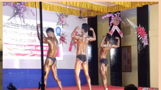
Medal Winners of GU Inter College Competition, 2019