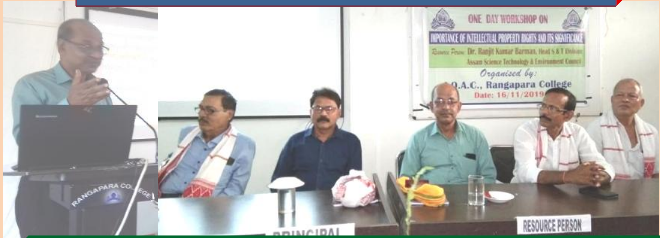
Workshop on Intellectual Property Right (16-11-2019)