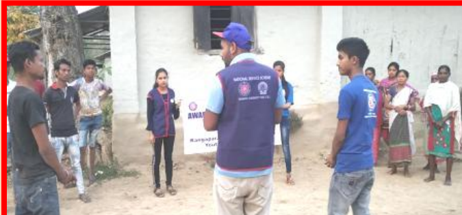
Awareness on COVID-19 (NSS)