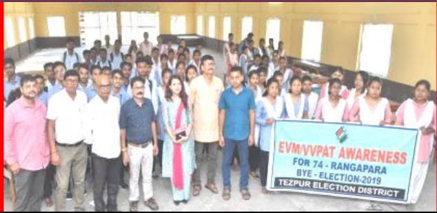
Awareness on EVM/VVPAT