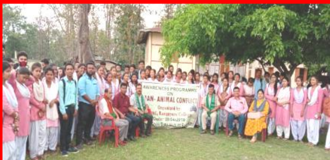
Awareness on Man-Animal Conflict