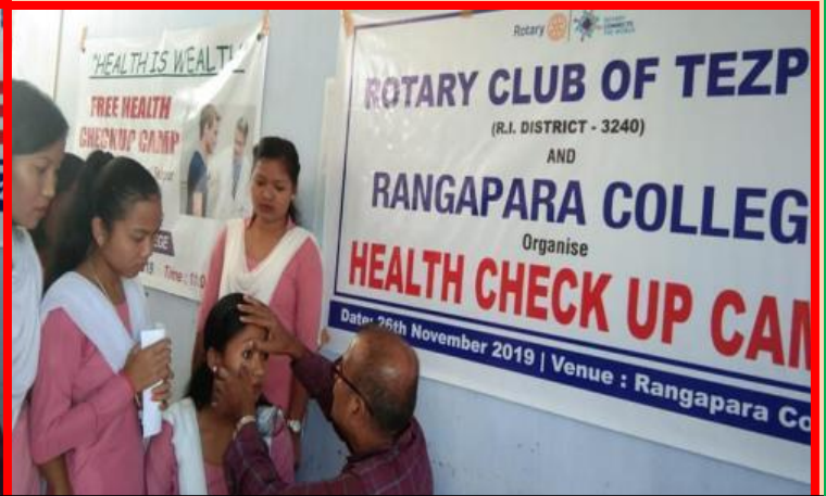
Free Health Check-up Camp in Association with Rotary Club of Tezpur