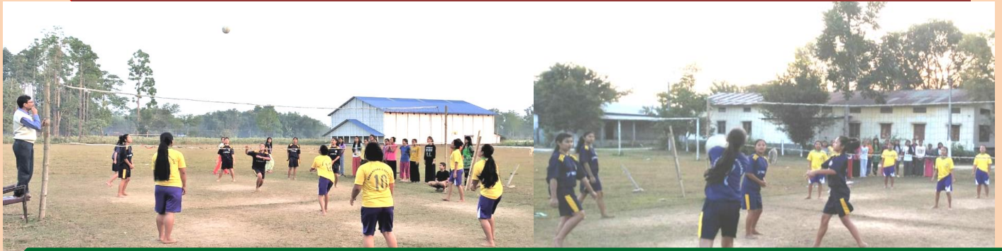
Woman Volley Ball Team of Rangapara College