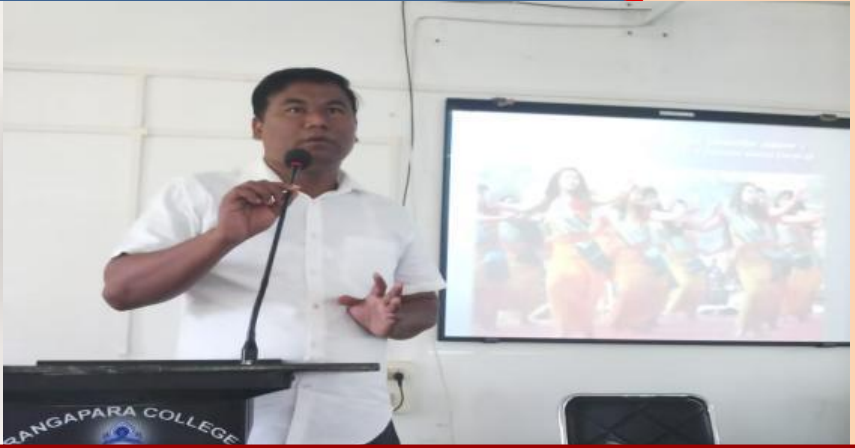
Faculty Exchange Programme