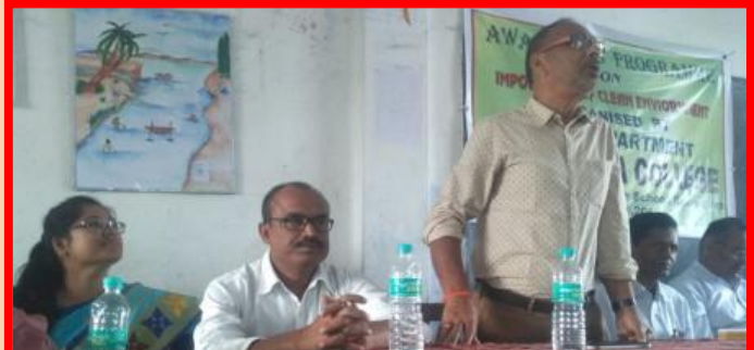
Awareness on Environment (Dept of Hindi)