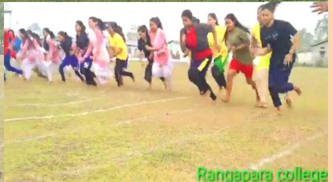
Annual Sports Week, 2019-20