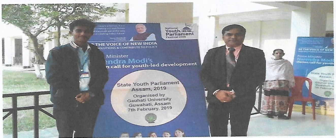
Figure: Photographs from the event