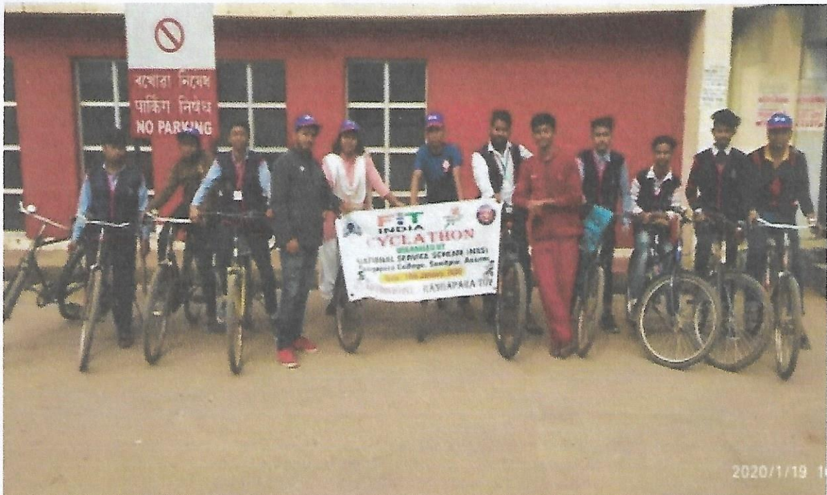
Figure 1: Photographs from the cycle rally