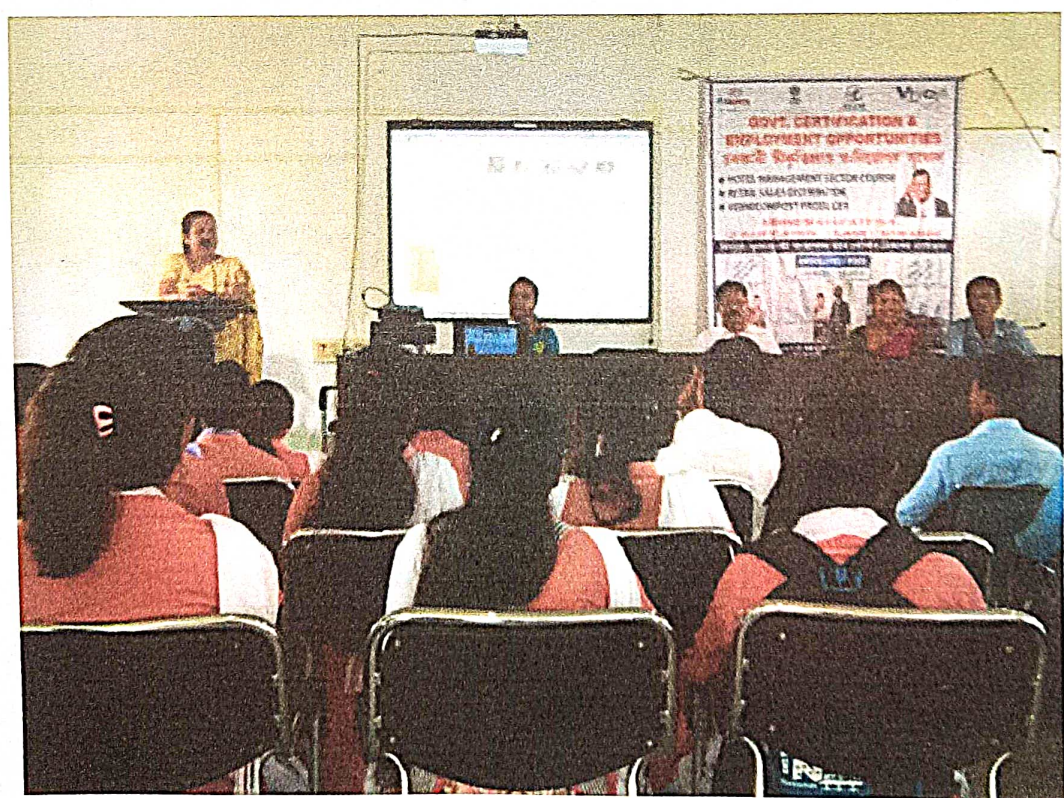
Students participating in the event