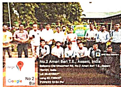
A few Photographs of the plantation event