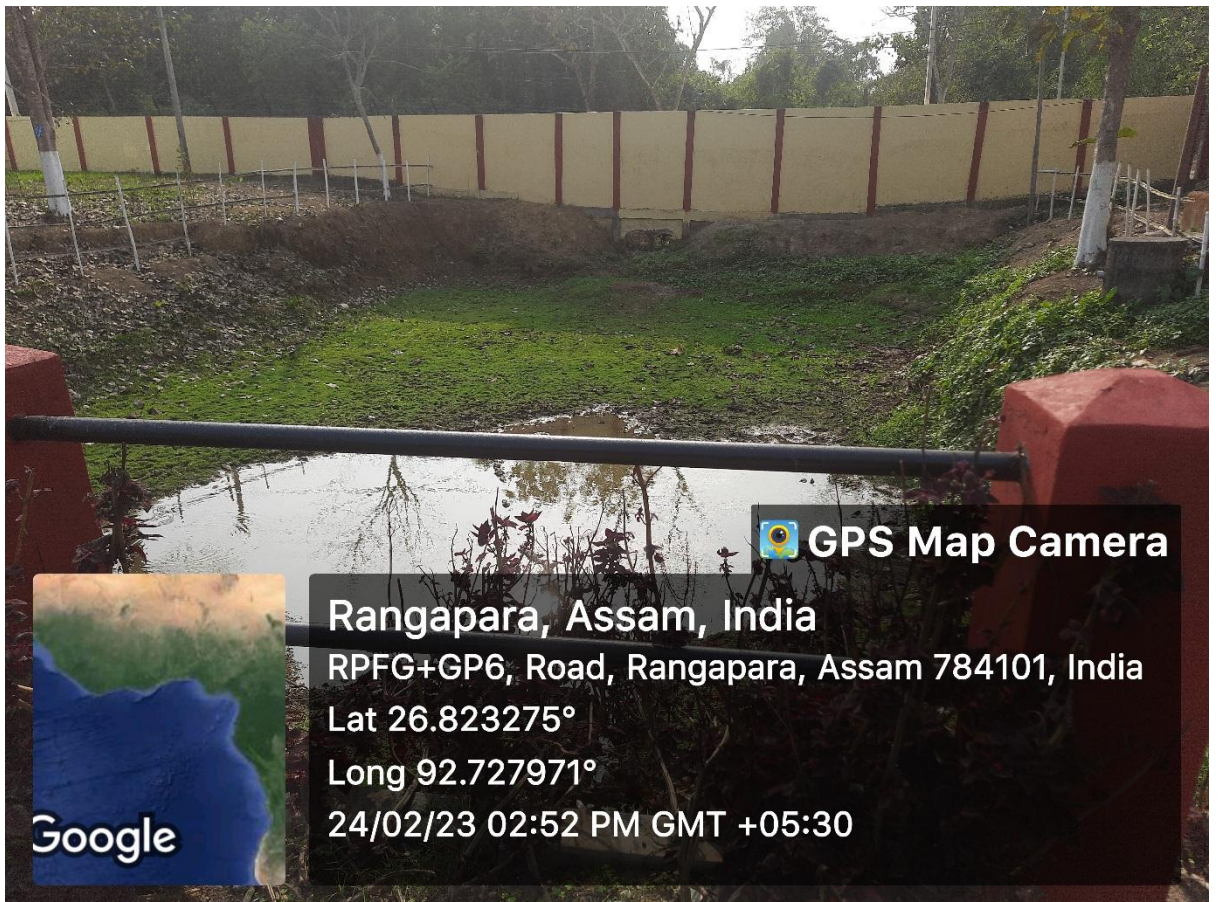
Rainwater Harvesting near Room No-21