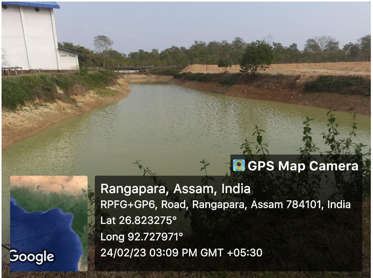
Rainwater Harvesting near Girls' Hostel and Indoor Stadium