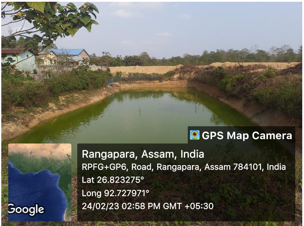
Rainwater Harvesting near Girls Hostels