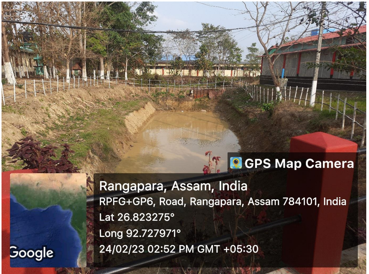
Rainwater Harvesting behind Science Laboratory