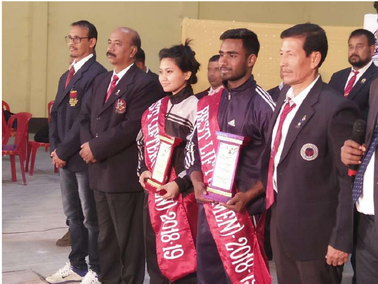
Gauhati University Inter-College Weight Lifting Competition-2019 organised in Rangapara College