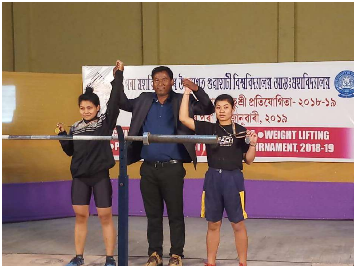
Gauhati University Inter-College Weight Lifting Competition-2019 organised in Rangapara College