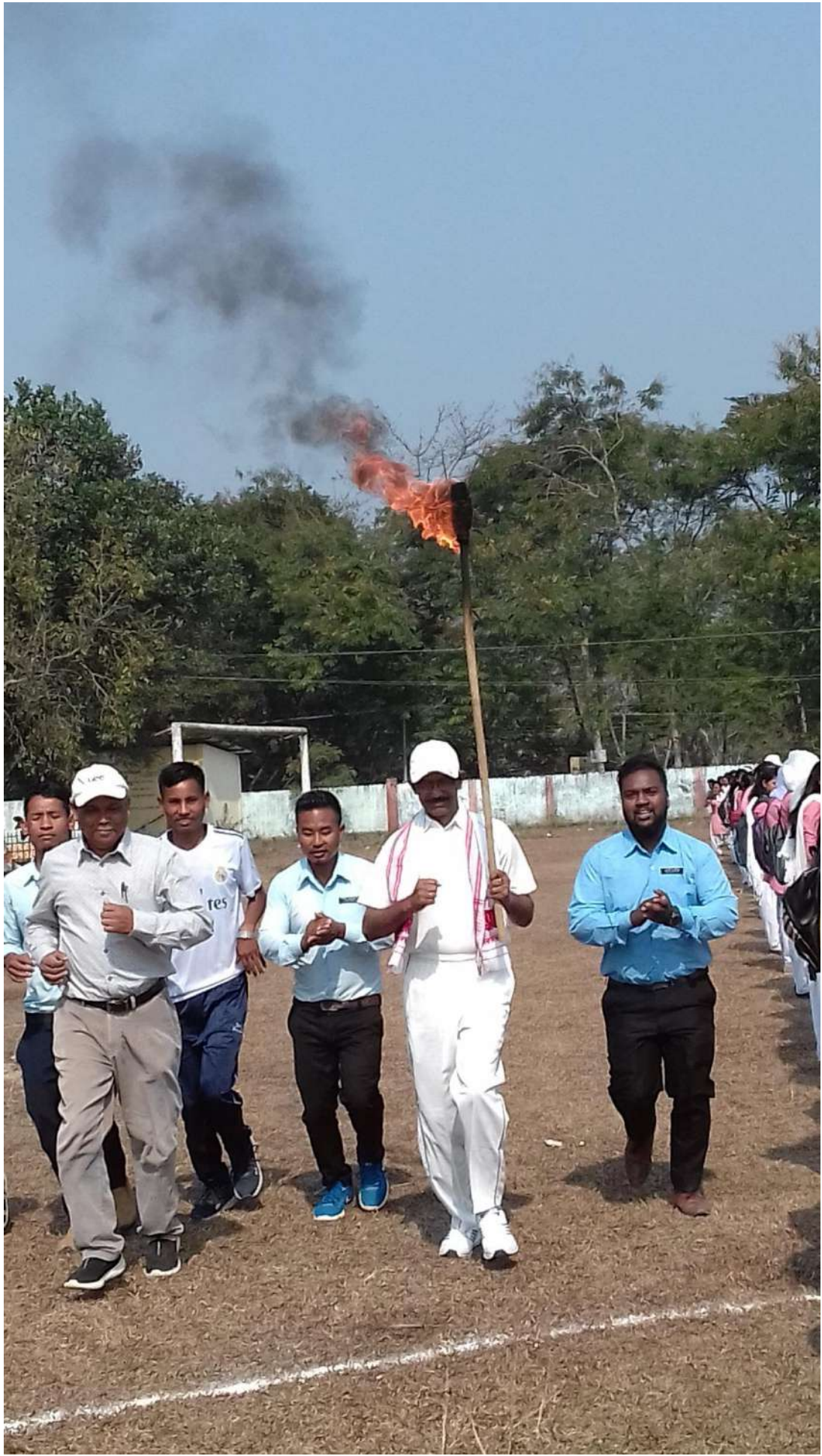
College Week 2018-2019