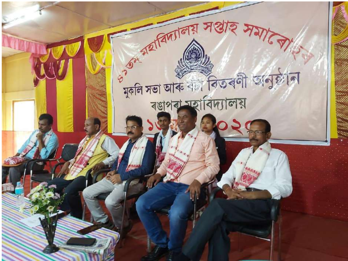
College Week 2019-20