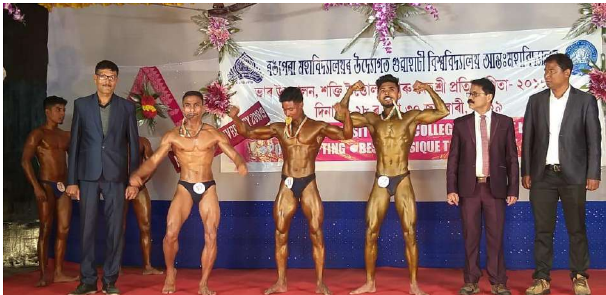
Gauhati University Inter-College Weight Lifting Competition-2019 organised in Rangapara College