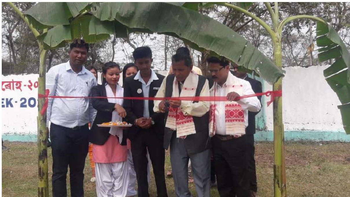
Inauguration of College Week-2019-20