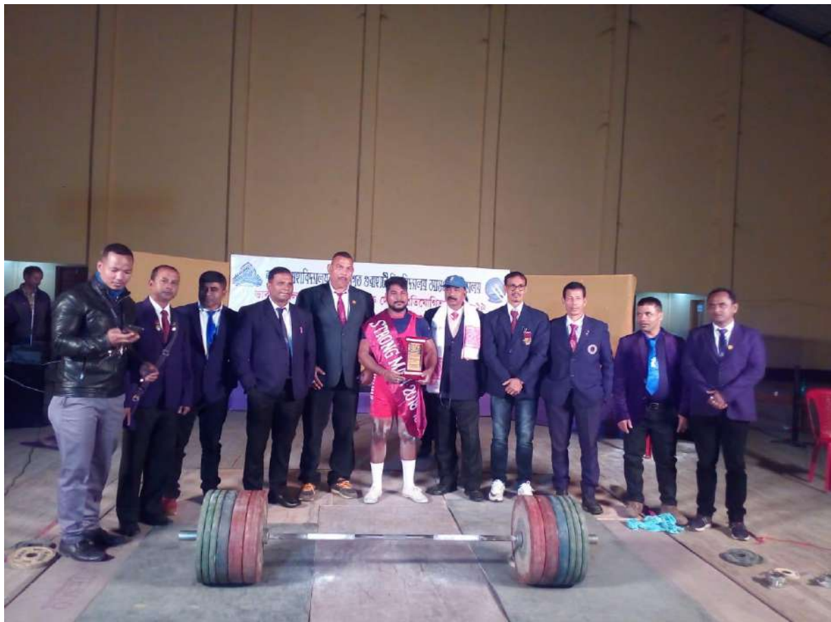
Gauhati University Inter-College Weight Lifting Competition-2019 organised in Rangapara College