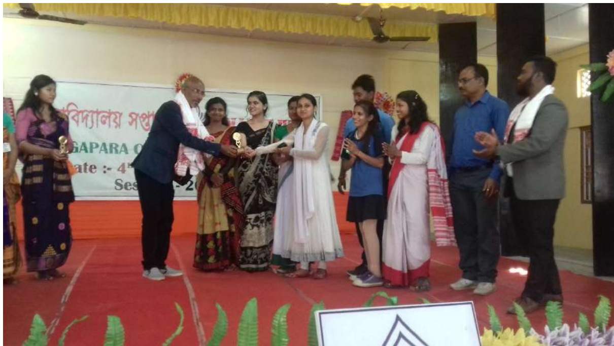
College Week 2018-2019