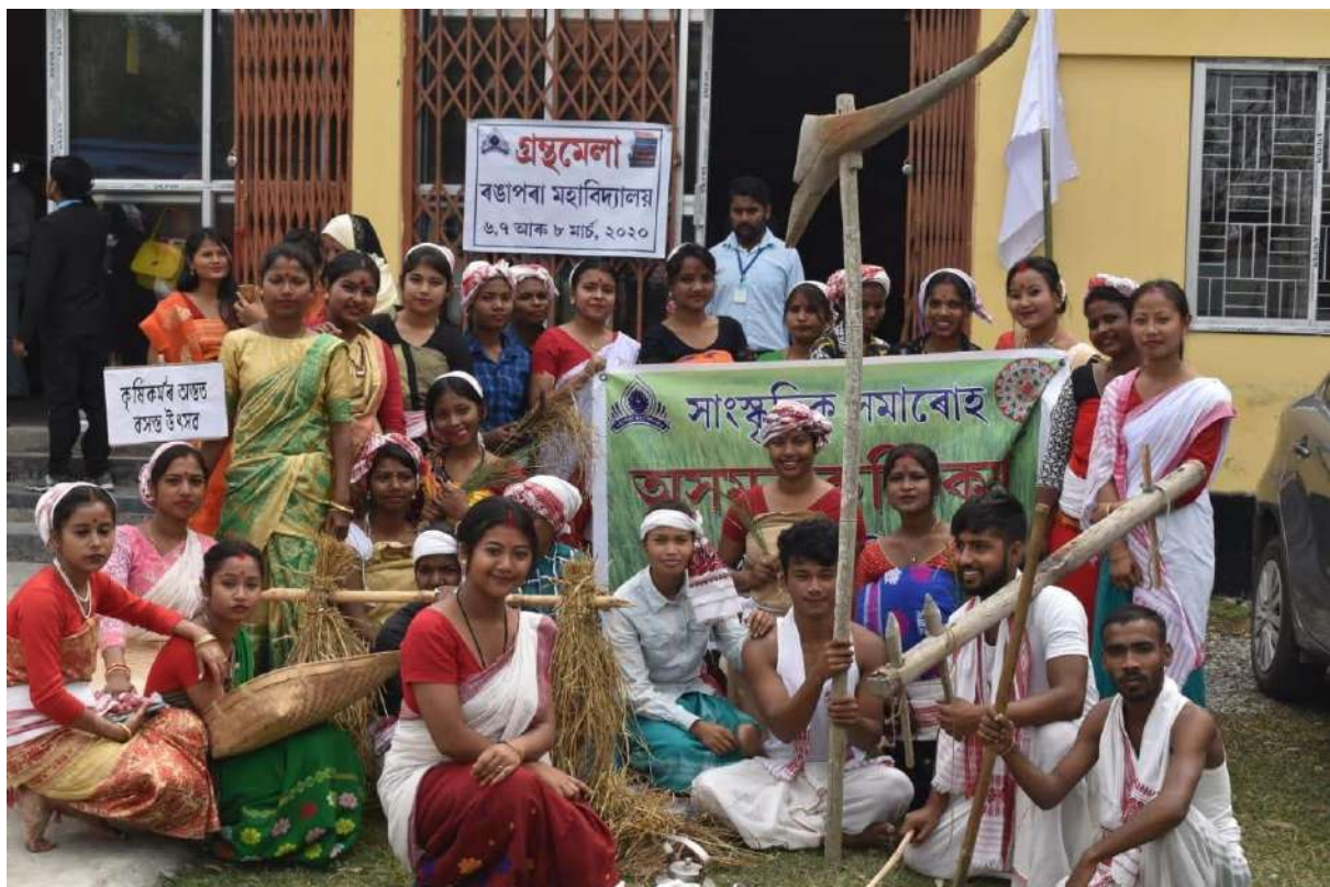
Cultural Events 2019-20