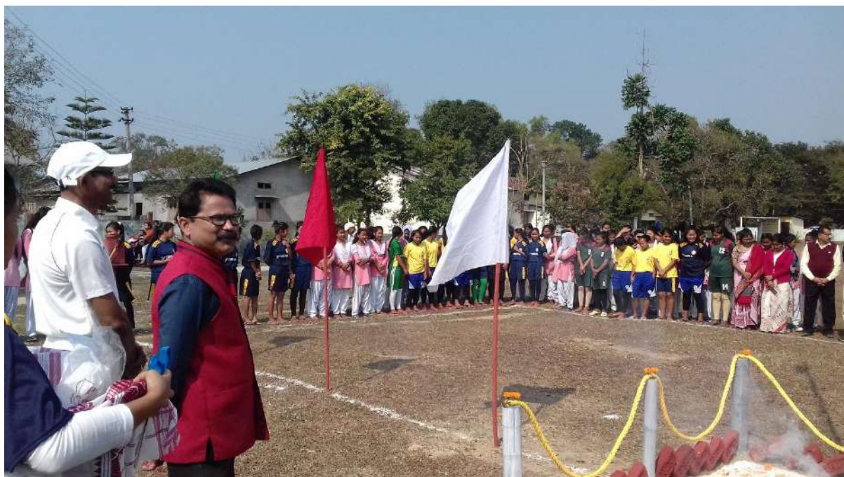
College Week in 2018-2019