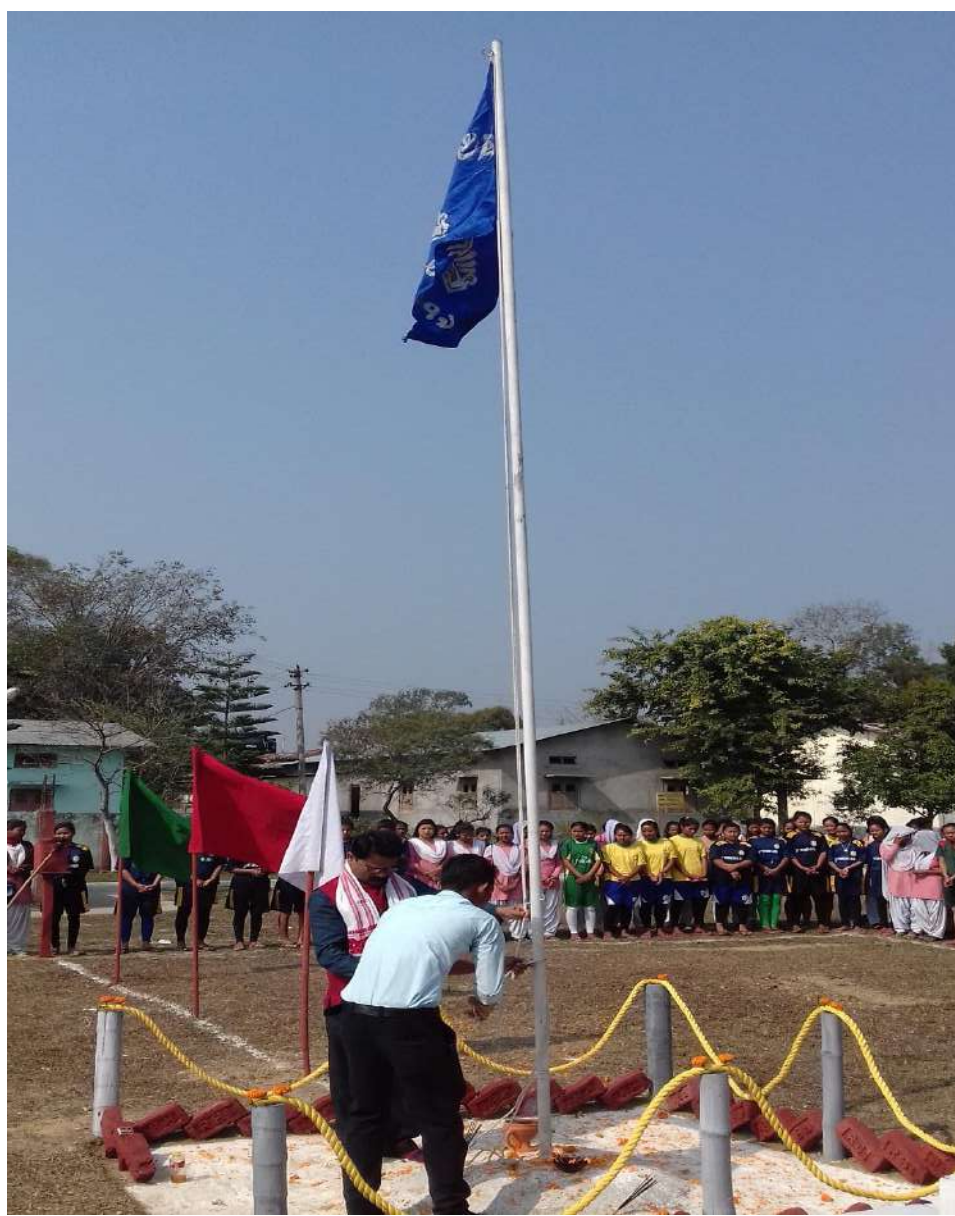
Hoisting of College Flag before the opening of College Week 2018-2019