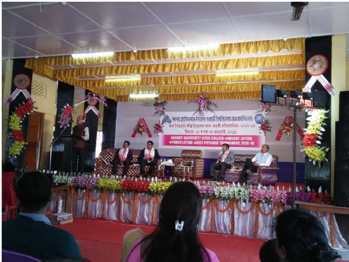
Gauhati University Inter-College Weight Lifting Competition-2019 organised in Rangapara College