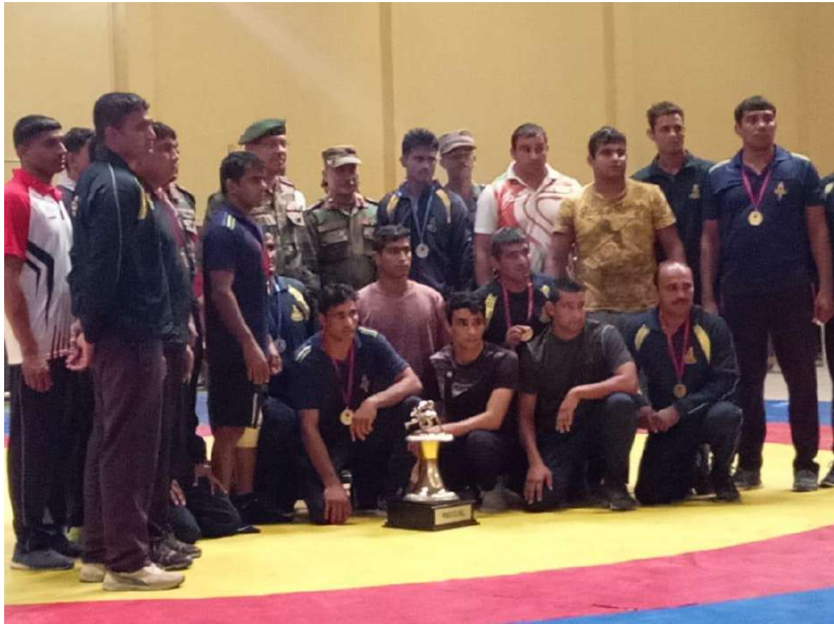
Gauhati University Inter-College Weight Lifting Competition-2019 organised in Rangapara College