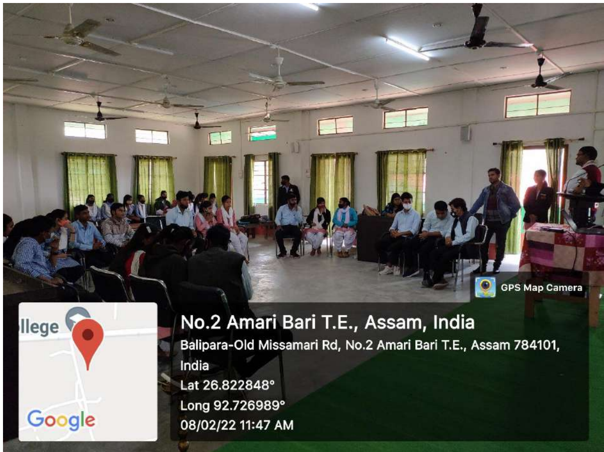
College Week 2021-2022