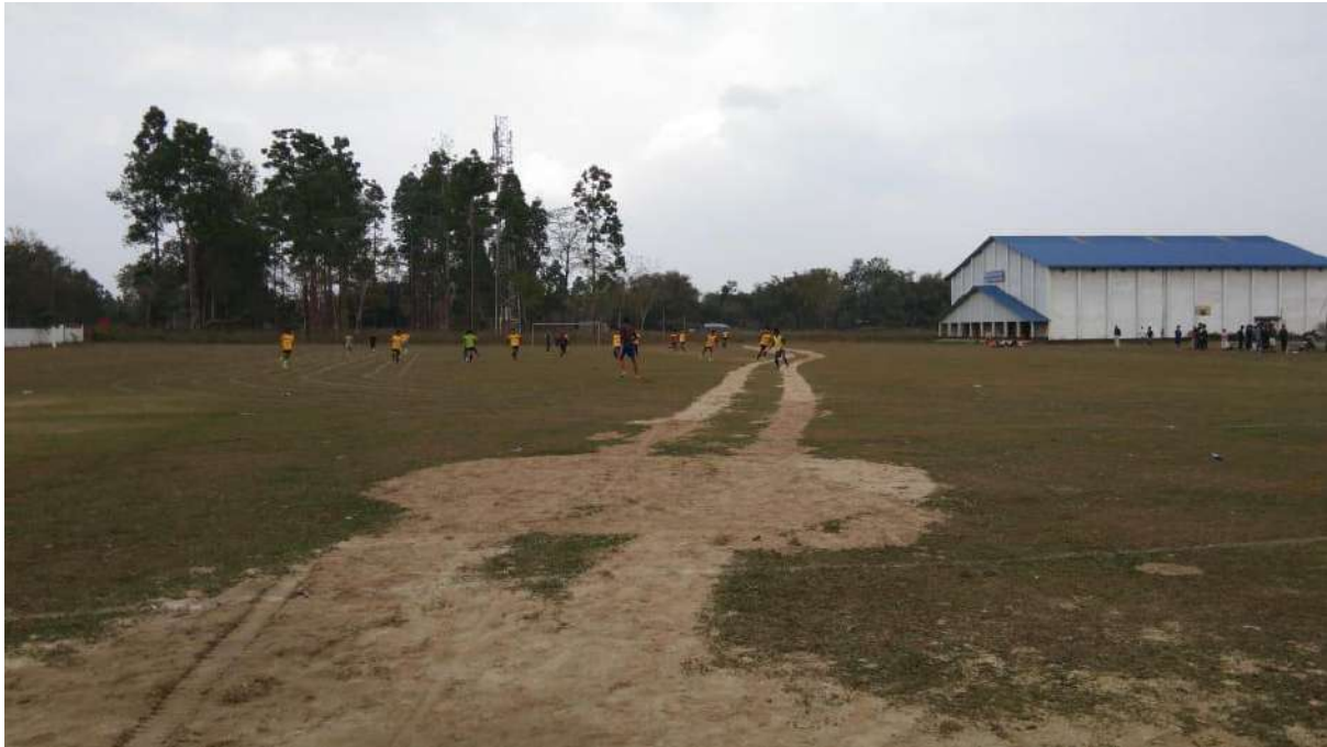
Football Match is being played (2019-20)