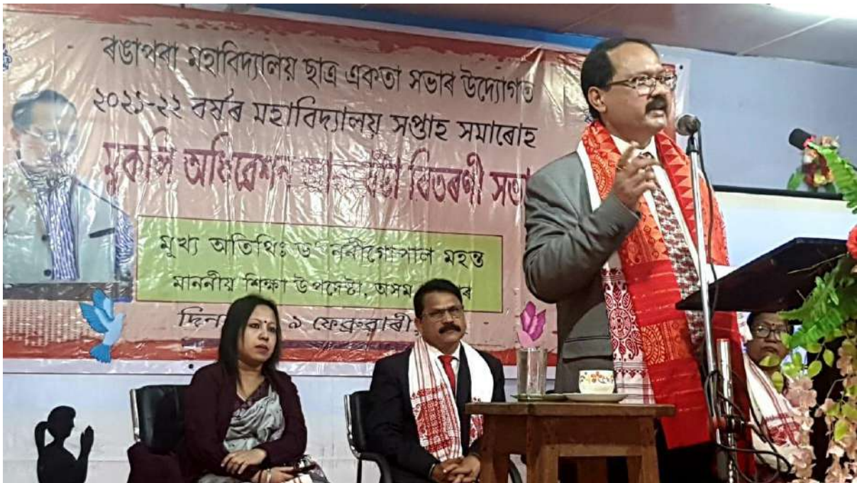
College Week 2021-2022