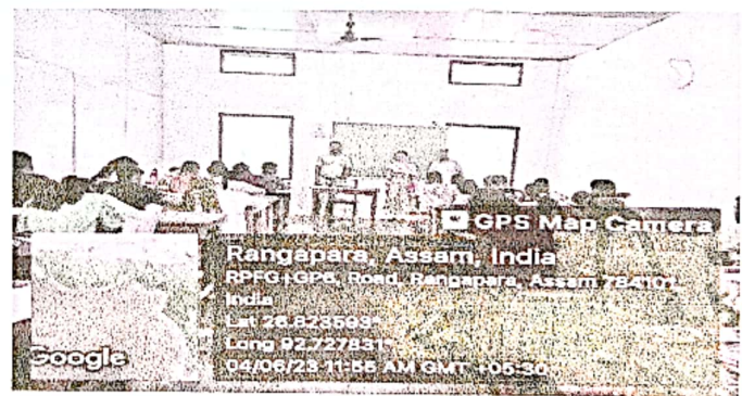
Art competition among the school students