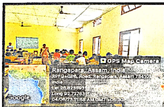
Art Competition among the school students