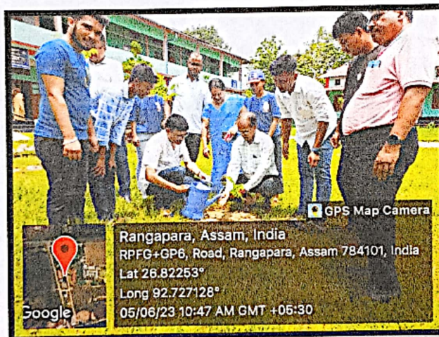
Plantation drive on 5 th June, 2023