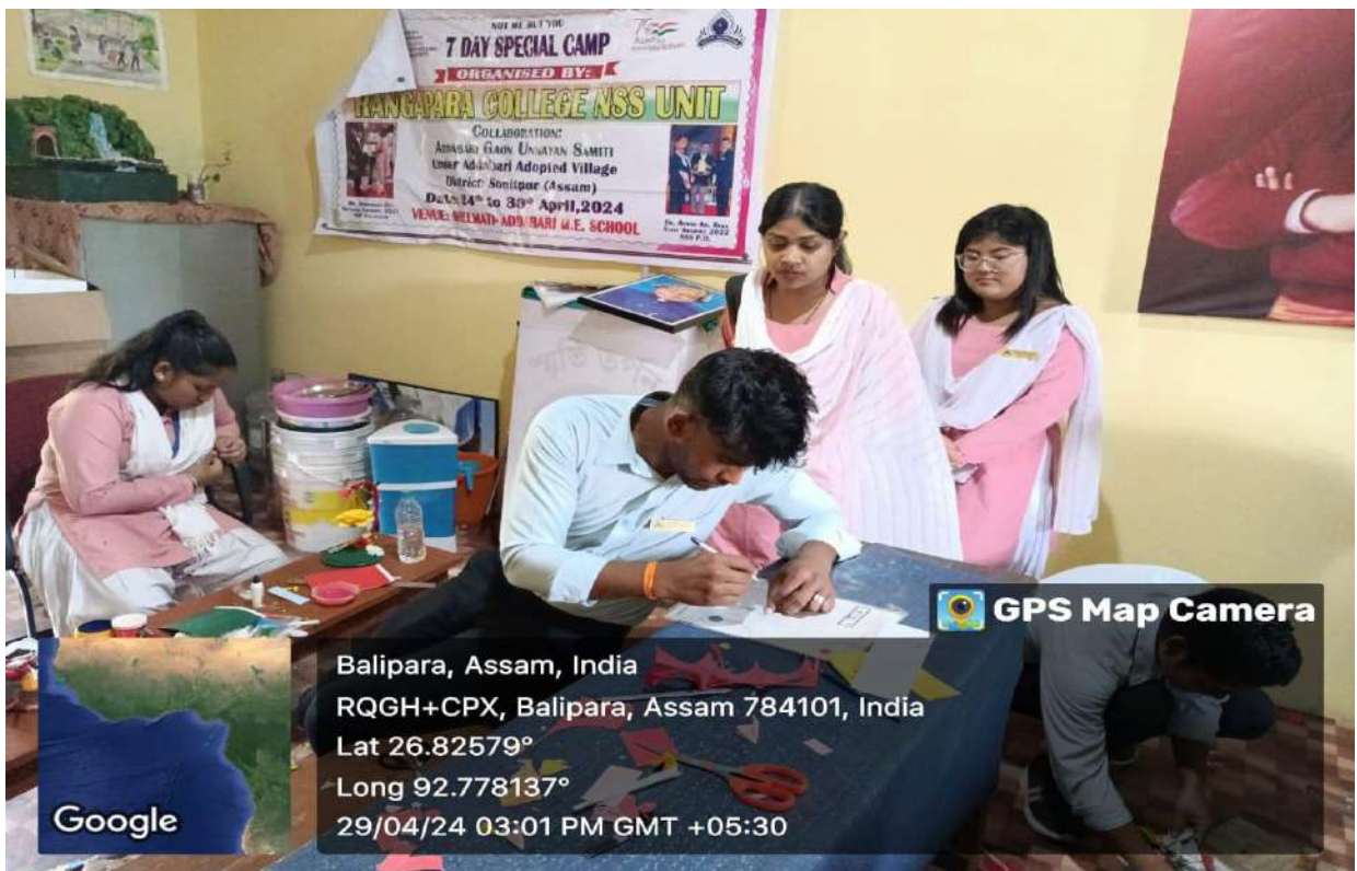
Figure: Photographs of the Event