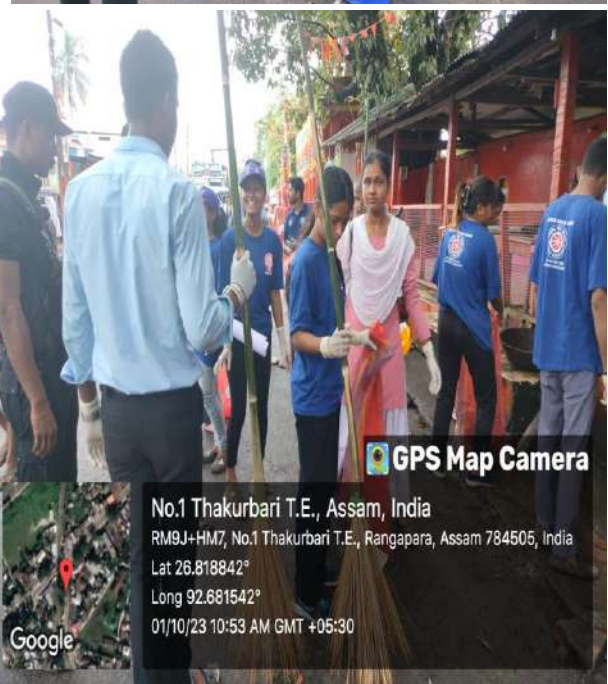
Figure: Photographs of the Event.