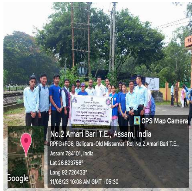
Figure: Photographs of the Event.