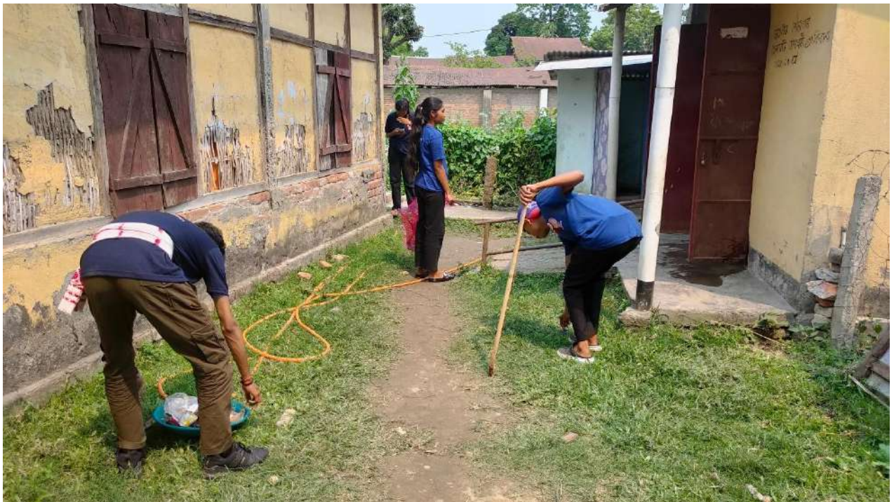
Figure: Photographs of the Event