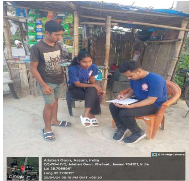
Figure: Photographs of the Event