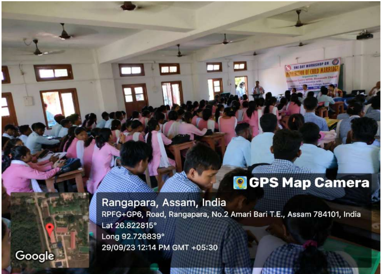
Figure: Photographs of the Event.