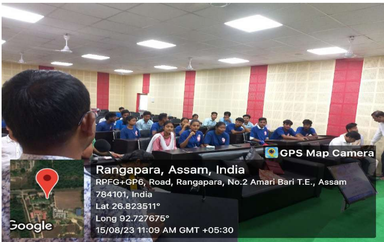
Figure: Photographs of the Event.