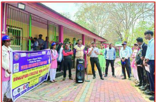
Figure: Photographs of the Event.